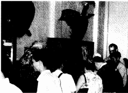
Participants in the Reference Collection at RIMP, Haiphong.