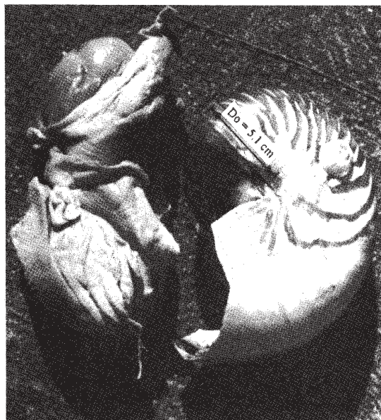
Figure 1. Nautilus pompilius collected near Racha Noi Island. The length of a line from the adoral end of the black band to the umbilical center (DO) is 5.1 cm. The soft body weight was 552 g.

In order to provide stronger evidence, a reward was offered for the discovery of living Nautilus . However, live specimens have not been obtained but a Nautilus pompilius with soft body was handed over to the junior author by a sea gypsy in March 1992. The Nautilus (Fig. 1) was found floating dead near the Raja Island off the Phuket coast (Fig. 2), southern Thailand. This finding gives circumstantial evidence that N. pompilius occur in this area and indicated that N. pompilius shells found on the beach of Tarutao, Langawi and Penang islands should have come from the eastern part of Indian Ocean-Andaman Sea, rather than from the Philippine sea area.